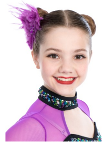
TWO MEDIUM HIGH BUNS

Parted in the middle create two pony tails at crown of head. Very slicked and sprayed. Two bun created in the shape of a cinnamon bun, laying flat on head. No sock buns, please. Two hair nets required and placed around buns and secured.