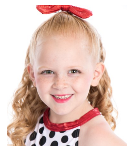
HAIR HALF UP

Front slicked and sprayed. Elastic band centered on crown of head. Back curled.