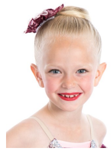
MEDIUM HIGH BUN

Very slicked and sprayed. Elastic band centered on crown of head. Bun created in the shape of a cinnamon bun, laying flat on head. No sock buns, please. Hair net placed around bun and secured.