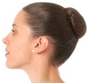
CORRECT Shape of Bun